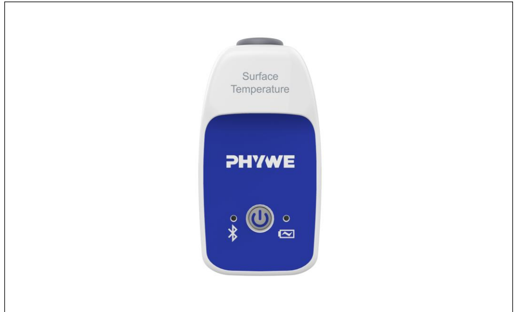
Fig. 1: 12917-01 Cobra SMARTsense Surface Temperature