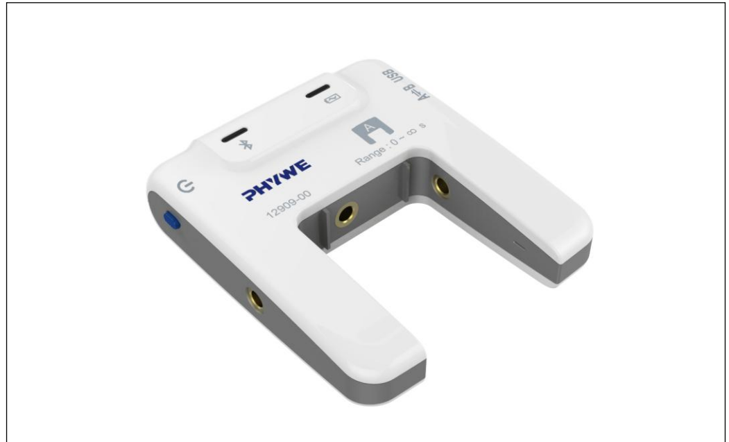
Fig. 1: 12909-00 Cobra SMARTsense Photogate